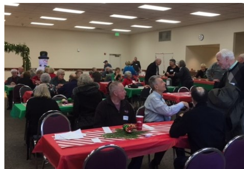
TELOS/TSO Bi-Annual Holiday Party and Business Meeting—Dec. 5, 2018