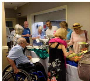
TSO Bi-Annual Business Meeting and Summer Picnic August 19, 2017

TELOScope is brought to you by the TELOS Student Organization (TSO) http://tso-telos.org