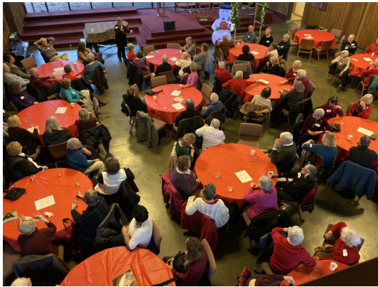
TSO Holiday Meeting was held at the Unitarian Church